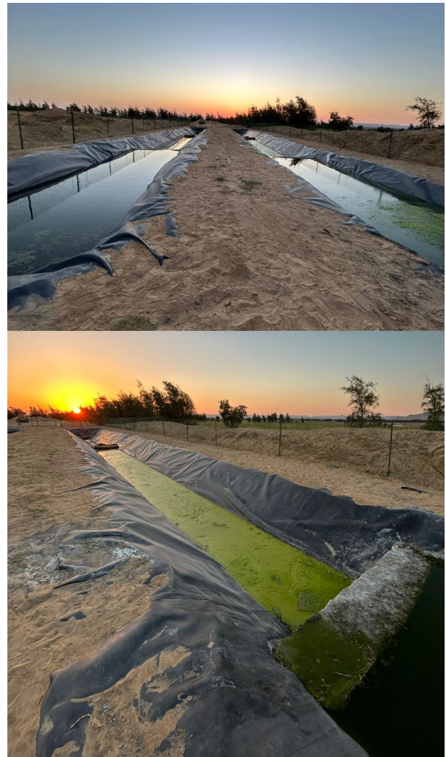
Fig. 2 The installed low-cost nature-based and efficient engineering constructed wetland treatment site in Sekem El-Wahat El-Bahariya, Egypt

The installation and operation of a low-cost and nature-based CWT site in Sekem Farm El-Wahat was accomplished under the research REUSE project [19]. The target is to get-ride of the wastewater hazard and to increase water availability for irrigation while reducing pressure on conventional freshwater groundwater resources. The treated water is used for irrigating non-fruitful trees, Bamboo trees, canopy, shrubs, cactus and vegetation. Irrigating edible crops is prohibited because of the possible health risks [17]. At the outlet of the CWT system, an irrigation pump conveys the treated water to the irrigation ditches, so that the green spaces are getting surface irrigation water by gravity. The REUSE project results emphasized that the treatment efficiency is higher than 90%, therefore the residual constituents in the treated water are insignificant. Accordingly; the human and environmental impact was proven nil on the long term [19].